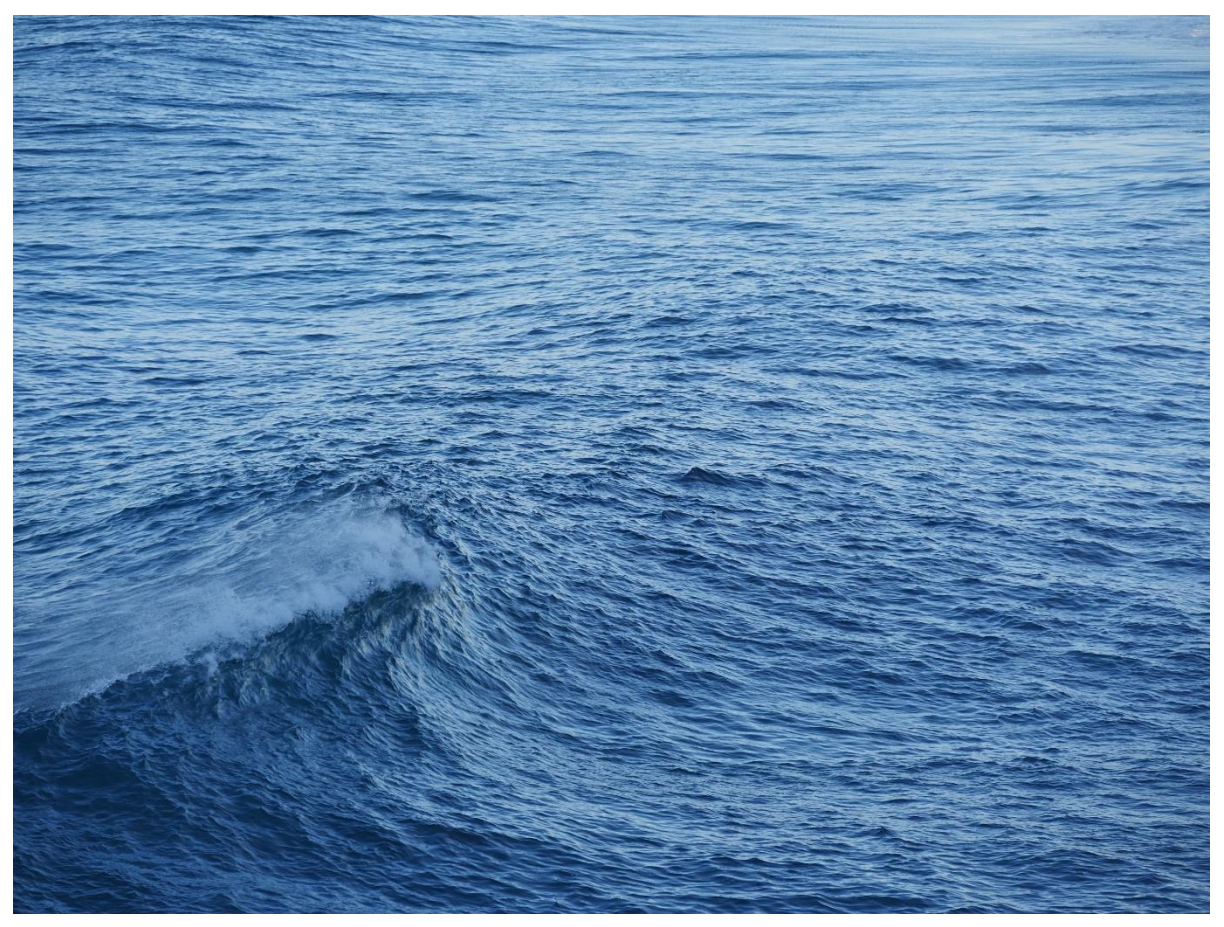
Waves arriving at Praia da Bordeira, Southwest Alentejo and Vicentine Coast Natural Park

This area of Europe struggles with both water scarcity and overabundance, depending on the season. The Ocean shapes the life and the people of the Costa Vicentina Natural Park, but at the same time the summer months become dryer and dryer and desertification is on the move. January and February tend to bring a lot of rainwater in a short amount of time, leading to dampness, moldy houses, and flooded roads. In the summer heatwaves and intense tourism activity depletes groundwater.