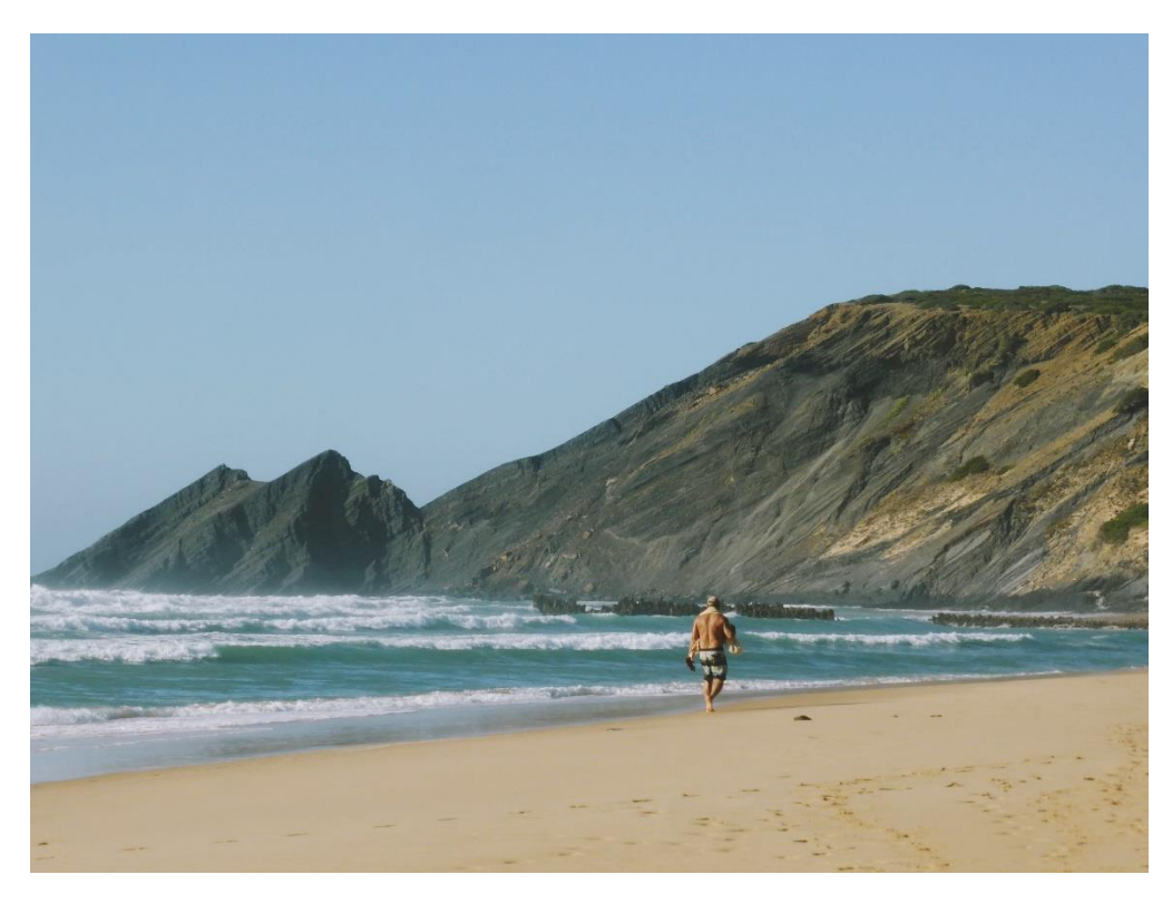
'Tourists are always the others' Praia da Amoreira, Southwest Alentejo and Vicentine Coast Natural Park