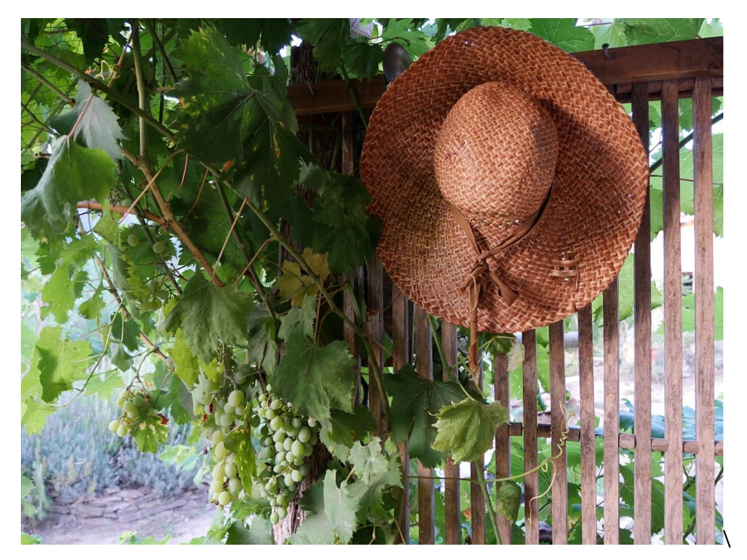
'Farmlife in the Alentejo' near Vila nova de Milfontes, Southwest Alentejo and Vicentine Coast Natural Park.