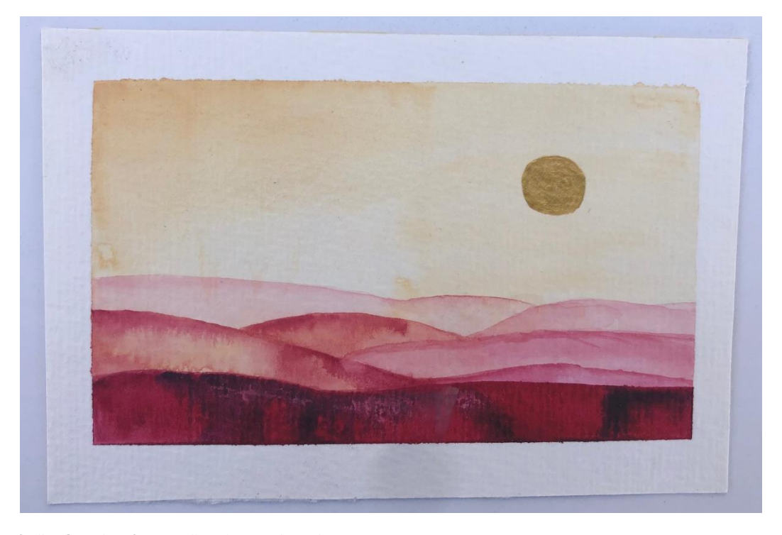
'Hills of Bordeira' Aquarelle colour and Acryl on paper