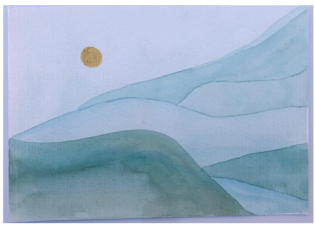
'Praia da Bordeira' Aquarelle colour and Acryl on paper

Near the village of Carrapateira, Bordeira Beach extends over a broad stretch of sand and sand dunes. A small river reaches the sea here and forms a lagoon. The seabed along the coast also boasts considerable biodiversity. Praia da Bordeira is backed by sand dunes and rugged limestone cliffs. Behind the beach there is a forest of ancient pine trees. The cliffs of Bordeira are famous for their fishing spots, almost inaccessible and highly sought after by many seabirds that find shelter here.