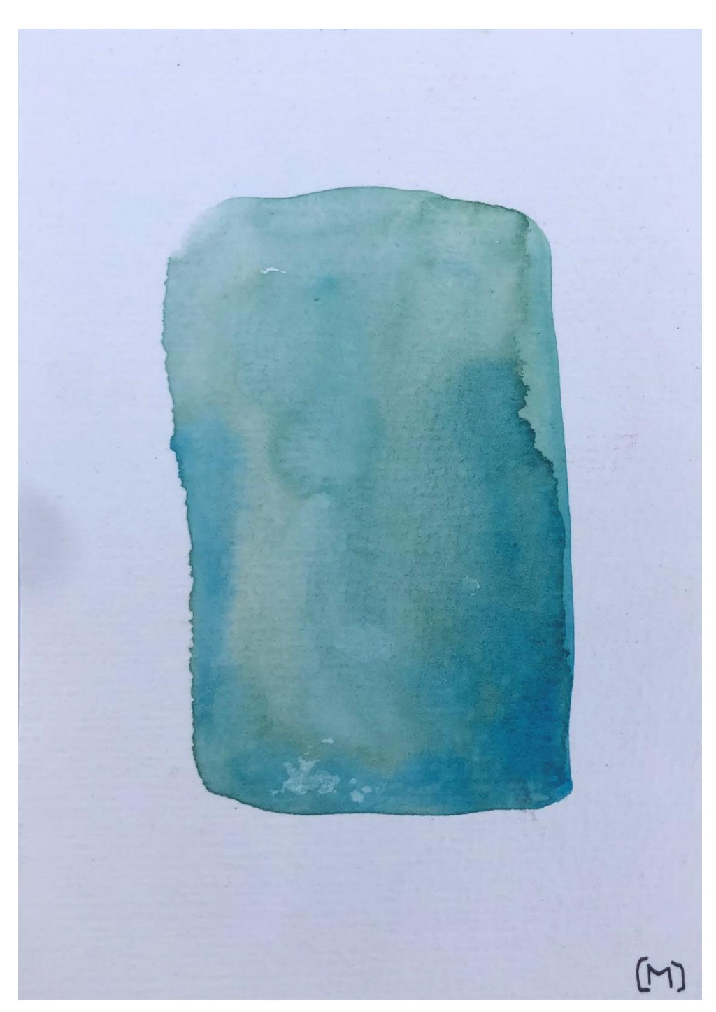
'Body of water' Aquarelle colour on paper