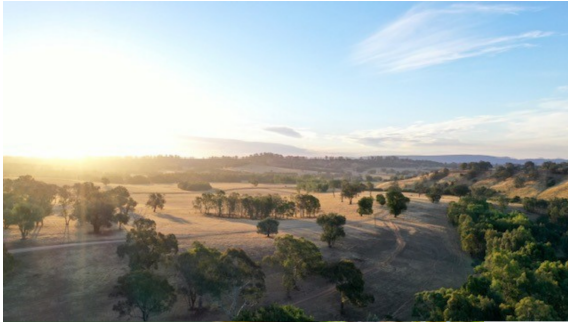
Woomargama Station