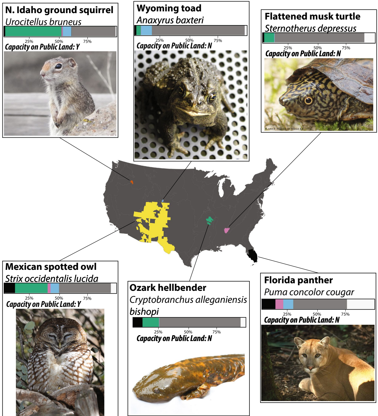
Figure 3. Examples of endangered species that would benefit from different combinations of public and private land conservation. Map colors show species' ranges; Uroditellus bruneus : orange, Anaxyrus baxteri : blue, Sternotherus depressus : pink, Strix occidentalis lucida : yellow, Cryptobranchus alleganiensis bishopi : green, Puma concolor cougar : black. Bar graphs indicate the percent of species ranges within each type of land designation; black: currently protected federal land, green: U.S. Forest Service and Bureau of Land Management, pink: other federal lands (e.g., Bureau of Reclamation, Department of Defense, etc.); blue: state land; grey: undeveloped private land; white: private cropland and developed land. Landcover data obtained from Bureau Land Management GIS repository 51 , species distributions were obtained from the USFWS Environmental Conservation Online System 47 . Capacity on Public Land indicates that at least 30% of the given species' range is within federal or state lands (Y), or if less than 30% of the given species range is within federal or state lands (N).