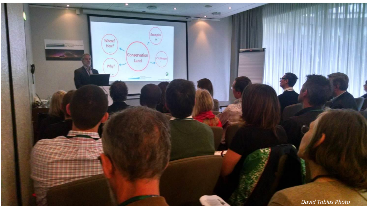
David Tobias Photo