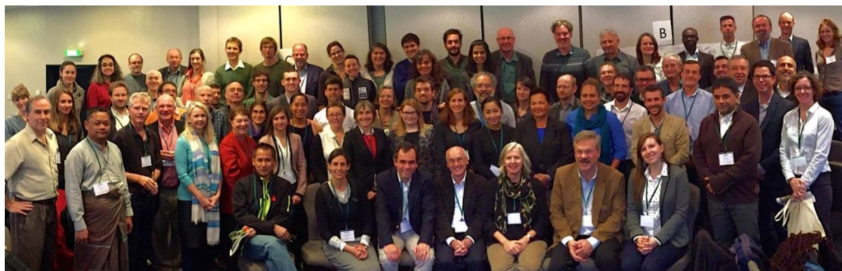
Congress participants