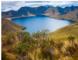
International Outlook for Privately Protected Areas: Summary Report