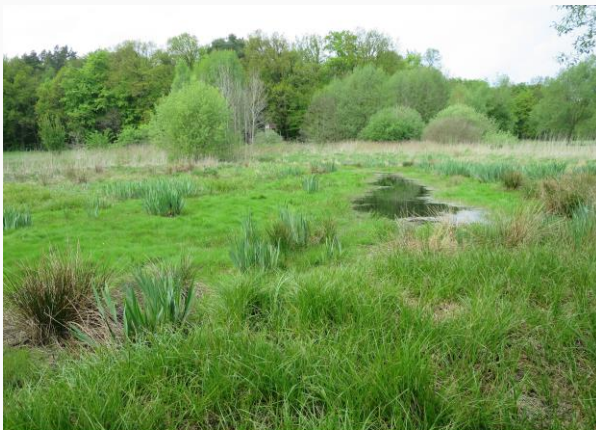
Privately protected wetland in Northern Brandenburg, Germany

The ILCN is pleased to share news of the recent start of a EU-cofunded project under the lead of NABU (Birdlife Germany) to create a European Private Land Conservation Network (ELCN). This network will be the first of its kind for European Union (EU) member countries, and the ILCN is excited to be a core partner in its development.