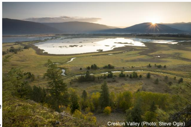
Creston Valley

There will be celebrations around the world on World Environment Day, and this is a special opportunity for privately protected area organizations, staff, and volunteers to take an active part in drawing the world’s attention to the critical role that healthy ecosystems and environments play right now and for future generations.