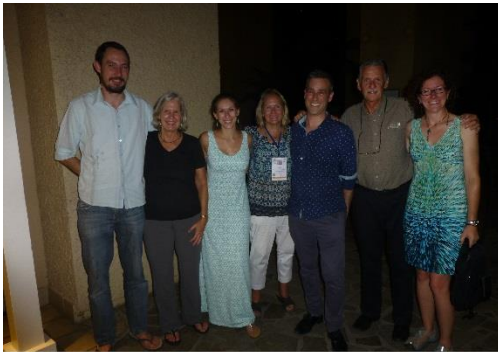
Many thanks to the friends of the ILCN who met up to share ideas, experiences, and stories. Looking forward to many more great conversations in the future.