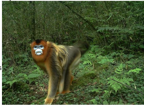
Sichuan snub-nosed monkeys image captured in the Laohegou Land Trust Reserve.

The reserve is also important from a research perspective; scientists have carried out a baseline inventory of wildlife, as well as set up dozens of camera traps to learn more about the numerous important species in residence. Already, the cameras have captured rare footage of a giant panda eating the remains of a takin; reinforcing the relatively new discovery that pandas are omnivores.