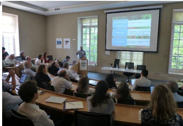
Pancho Solís gives a presentation on the successful passage of the Derecho Real de Conservación , which now allows private landowners to protect their land in perpetuity.

In order to start thinking about addressing these challenges, workshop topics included: examples of value capture in Latin America, restructuring insurance markets to make cities more resilient and financially sustainable in the face of intensified storm events, financial incentives for conservation as written into Chilean and U.S. law, compensatory mitigation, the role for conservation finance-oriented networks, where the conservation finance community of practice will go after COP21 in Paris, the potential role that capital markets might play in addressing climate change, and, particularly, how Chile is emerging as a global leader in land conservation.