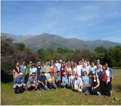
Workshop participants on a field trip to San Juan de Piche Nature Sanctuary, managed by Fundacion Robles de Cantillana.

Conversations were rich and wide-ranging, and the ILCN will soon share a compendium summarizing the main topics presented during the workshop.