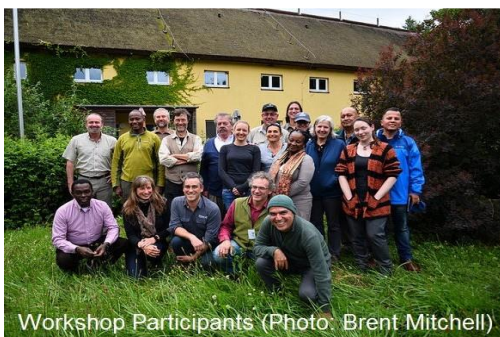
Workshop Participants

There is an increasing understanding of the important role privately protected areas (PPAs) play in reaching global biodiversity and protected area goals, as PPAs provide the opportunity for voluntary contributions to conservation, complementing the role of governmental agencies, indigenous peoples and communities in caring for nature.