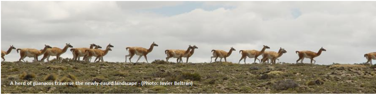
A herd of guanacos traverse the newly-eased landscape