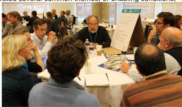
Participants discuss enabling conditions for cross-border collaboration in private land conservation

The ILCN will work to explore these common themes and challenges in greater depth in order to provide the community with new resources and educational opportunities that may support further cross-border efforts and knowledge sharing.